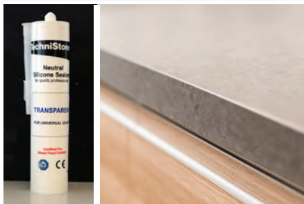
Always use neutral silicon.